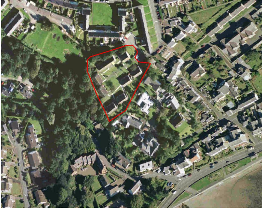
Figure 4 - Bryn Tirion, Beaumaris

Description – Bryn Tirion is a small cul-de-sac of local authority sheltered bungalows and extends to some 0.92 hectares (2.27 acres). The site is located in an established residential area however roadways are narrow and parking is at a premium. All of the properties are occupied on secured tenancy agreements therefore the properties are not readily available for development.