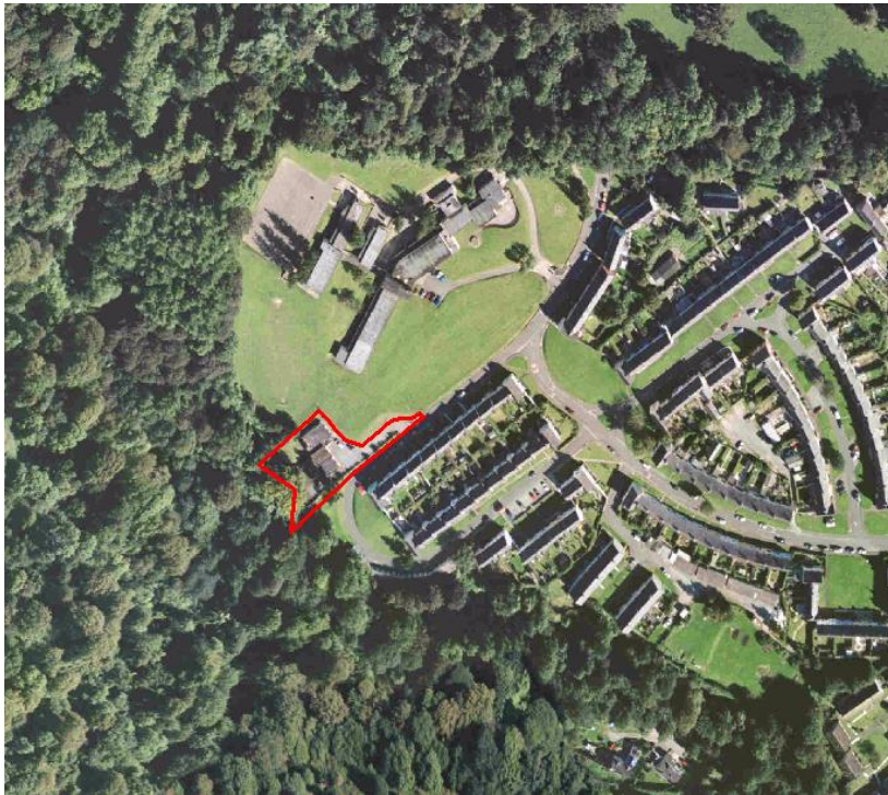
Figure 3 - Beaumaris Day Care Centre

Description – Property known as the Beaumaris Day Care centre which adjoins the Beaumaris School playing fields. The site extends to approximately 0.16 hectares (0.41 acres) with the building extending to approximately 215 m 2 . The property adjoins the neighbouring Beaumaris School playing field providing scope to extend the site area to accommodate larger development.