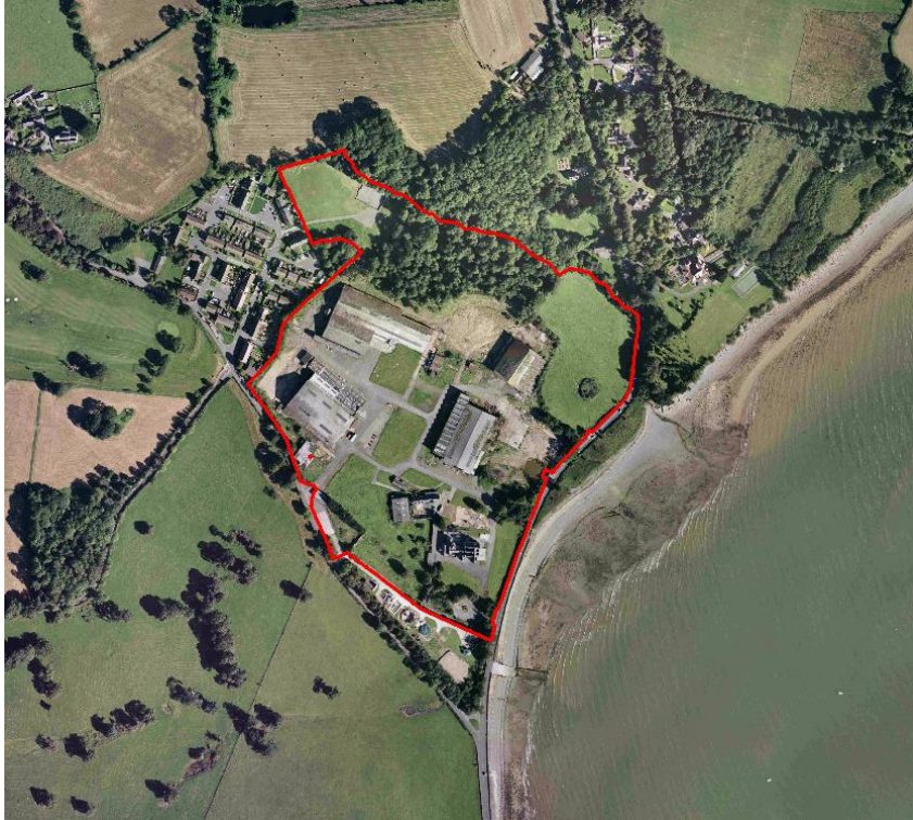
Figure 8 – Seiriol – Leirds, Llanfaes

Description – A privately owned site extending to approximately 5.96 Hectares (14.73 Acres). There are a number of industrial buildings on site which would require demolition and it is quite likely the ground is contaminated in part.