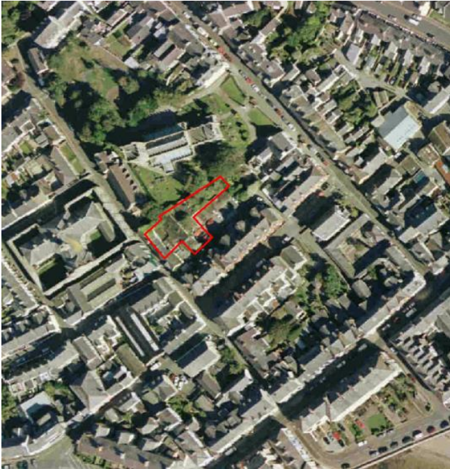
Figure 7 - Social Club, Beaumaris

Description – A privately owned former social club located close to the Beaumaris Town Centre. 0.07 Hectares 0.237 acres. The site comprises 2 mid terraced properties together with a former social club building to the rear. Access is problematic due to the nature of the roads and privately owned garages to the rear of the property. Space is also limited and the site is adjacent to the Church.