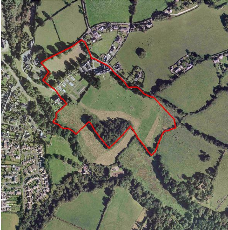
Figure 6 - Haulfre, LLangoed

Description – A Local Authority owned care home facility with grounds extending to approximately 8.41 hectares (20.79 acres).