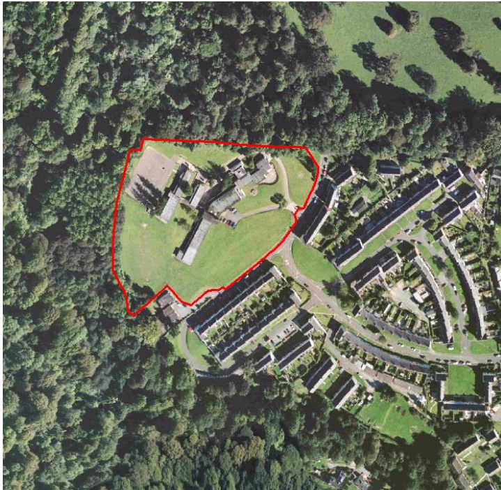
Figure 2 – Beaumaris Primary School

Description – The site extends to approximately 2.07 hectares (5.13 acres) which has been partially developed to provide a two-storey school building extending to approximately 2025m 2 together with playing fields. The site is already within the ownership of Anglesey County Council and may be available in a reasonable period. The entire site is located within development boundaries however the school building is Grade II listed and cannot be demolished.