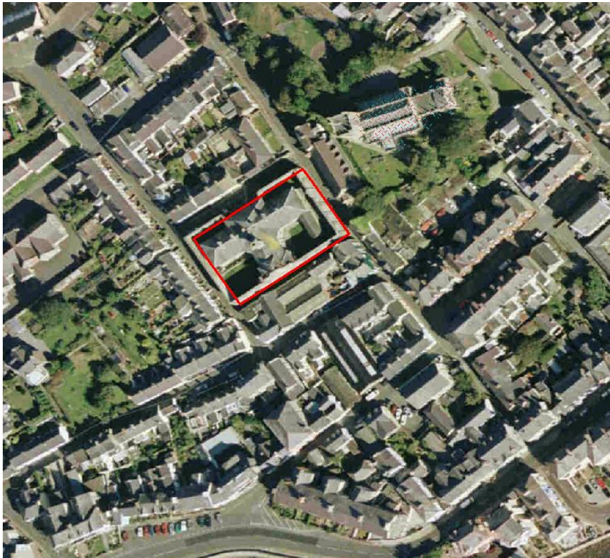
Figure 5 - Gaol, Beaumaris

Description – Historic Grade I listed former prison located close to the centre of Beaumaris. The site extends to approximately 0.17 hectares 0.42 acres and has been fully developed. Roads leading to the property are extremely narrow with a general lack of footways.